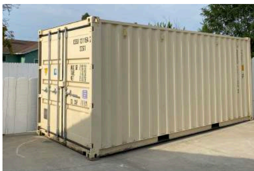
Youth Group Storage Container - located in the back parking lot, Photo submitted by Livier Ghamari-Brown