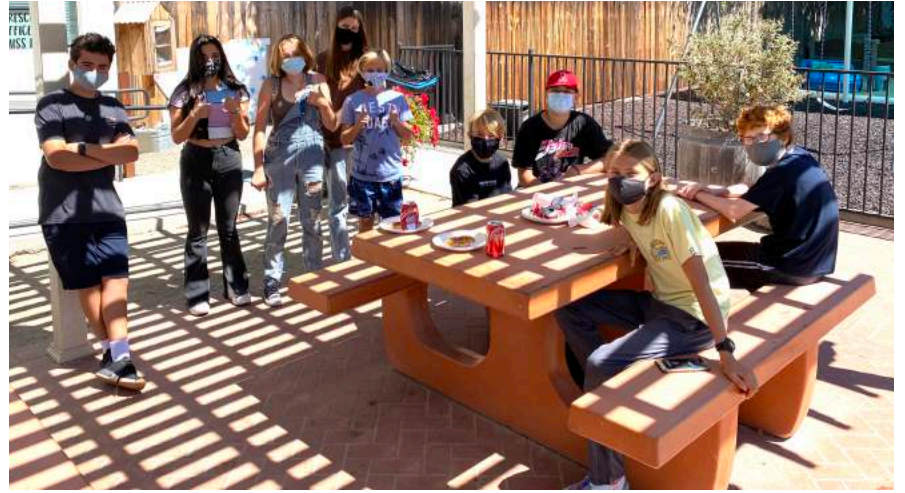
Youth Group at Day of Service and Lunch