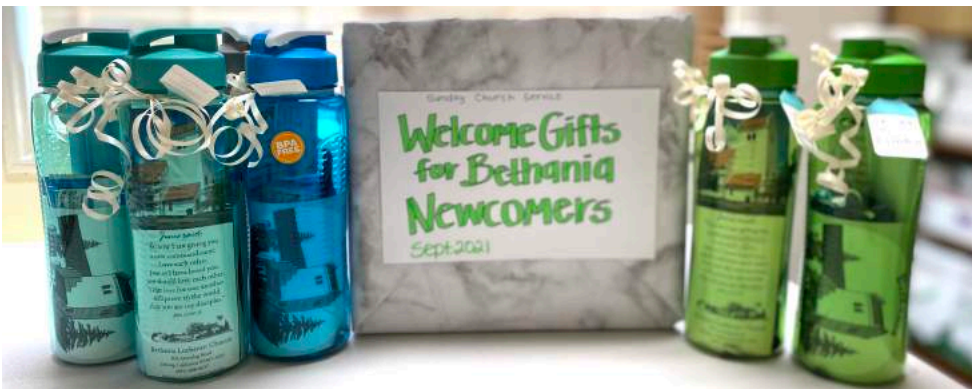
Livier made welcome gifts in September for newcomers.