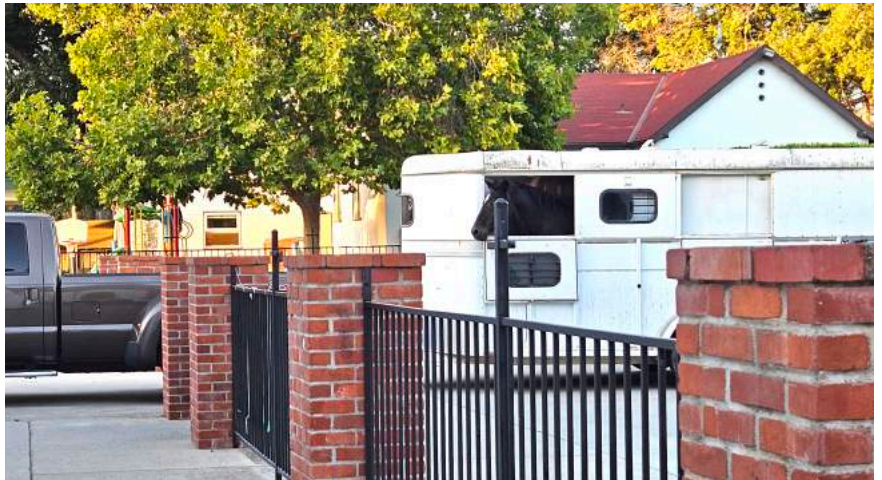
Photo at right....A first in the Food Distribution line - a horse!